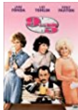
Nine to Five