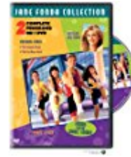
Fun House Fitness: Fitness for the Whole Family